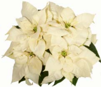
Christmas Season™ White