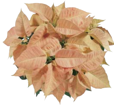
Christmas Feelings™ Cinnamon evol.