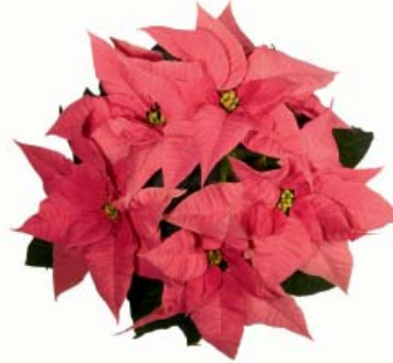
Christmas Season™ Pink