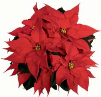
Christmas Season™ Fire

Our brand new, early-season Christmas Season series presents a high-quality look thanks to its large, showy bracts with thick, long-lasting centers and thick, sturdy stems. The energy-efficient varieties have dark green foliage, excellent branching, and very good post-harvest characteristics. These medium-vigor plants are adaptable to a wide variety of product forms.