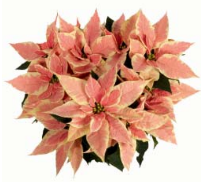
Christmas Angel™ Marbella

Merry White™ , a dark foliage cultivar, is earlier and more vigorous than Christmas Feelings White. Merry White just may be the perfect white cultivar to start the season and to use for painting.