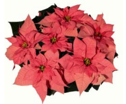
Christmas Carol™ Pink evol.