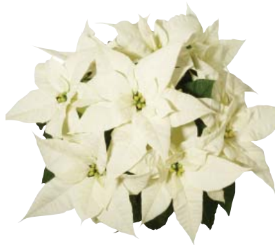
White Christmas® evol.

Christmas Carol™ Pink evol. was improved and now fits the series perfectly.