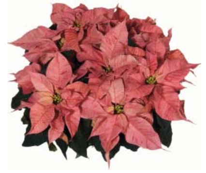
Christmas Feelings™ Red Cinnamon

We are adding two new and one improved variety to our best-selling Christmas Feelings series. They can be started and grown the same way as all other varieties in the series. Christmas Feelings Dark Salmon is a great, dark salmon orange, standing out in the crop. Christmas Feelings Cinnamon evol. was improved and now fits the series perfectly. A new and exciting addition is Christmas Feelings Red Cinnamon with its red-spotted, candy color on dark, almost black foliage.