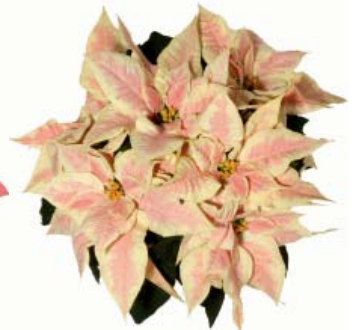
Christmas Season™ Marble