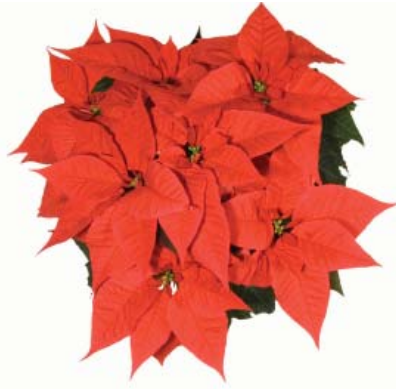
Christmas Feelings™ Dark Salmon