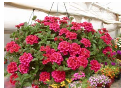
Lascar™ Hot Rose