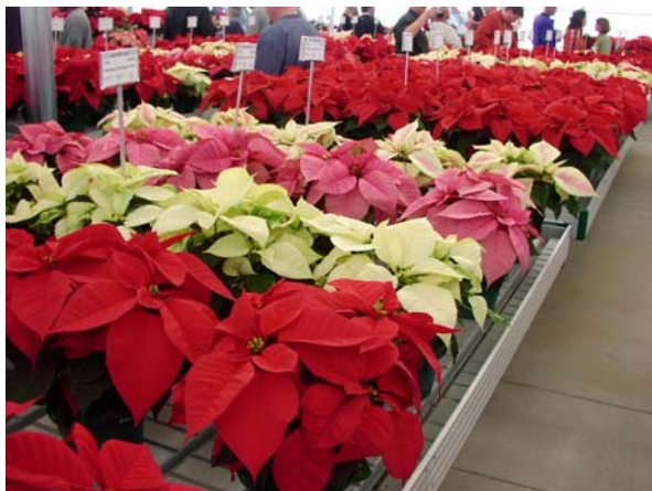
Christmas Feelings plus colors at the UOF trial

“Christmas Feelings series. ‘Christmas Feelings Red’ had made the best of trials list before, and this year, the series is being recognized for its uniformity of growth habit, consistent early midseason timing and quality of the colors. The series has a nice low to medium vigor with upright branching. ‘Christmas Feelings Red’ has large, bright-red bracts. This is a dark-leaf series, and the colors are as good or better than other dark-leaf varieties.”