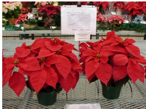
Christmas Feelings at the UOF trial

Christmas Feelings is part of the Graphical Tracking study (right image) done by the UOF, and data is available on their website.