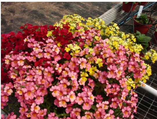
Serengeti® Tri-Color basket