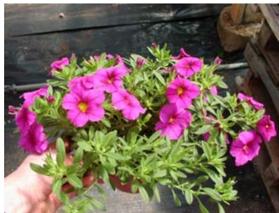
MiniFamous™ Super Purple