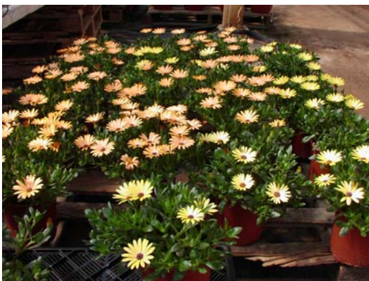
Kenai™ Osteospermum in gallon pots