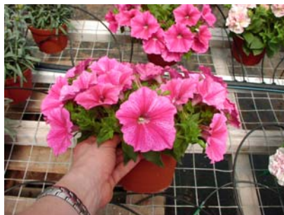
Fame™ Pink Star