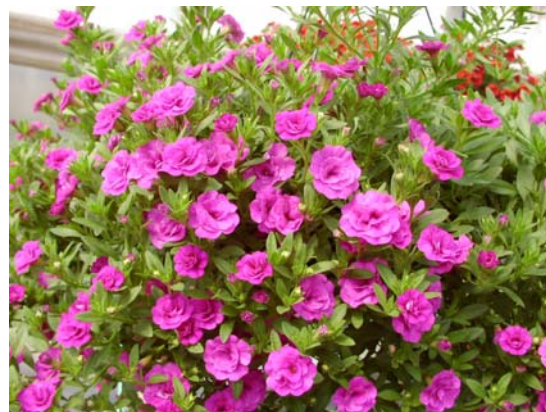
MiniFamous™ Double Pink