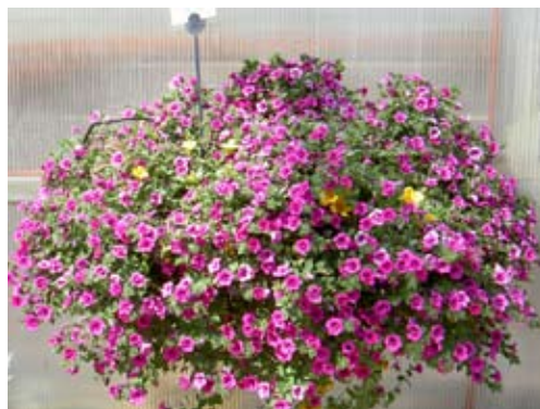
August 7, 2009