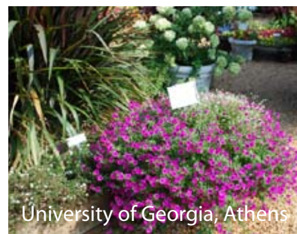
University of Georgia, Athens