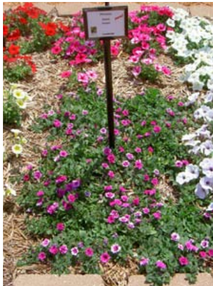
July 9, 2009