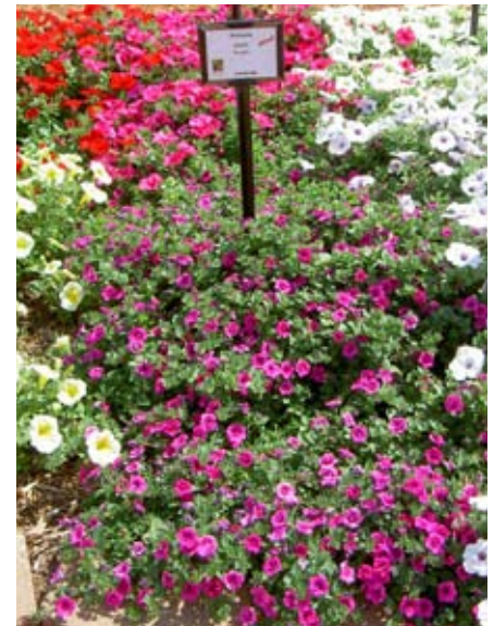
August 7, 2009