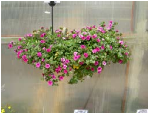
July 9, 2009