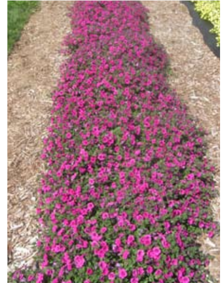
August 7, 2009