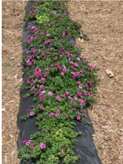
July 9, 2009

Wrapping up with the words from Mike Gooder of Plantpeddler: "The potential of the variety is solid."